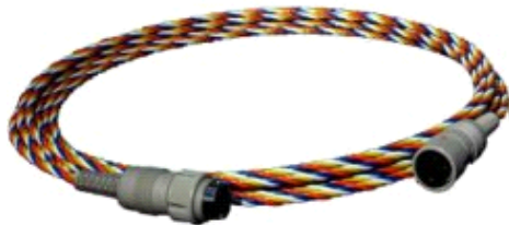
Detection cable in any length up to 50m